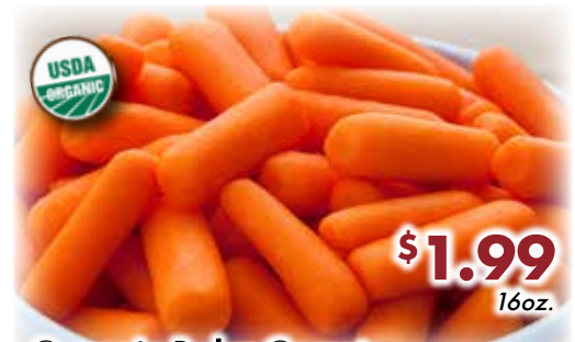
Organic Baby Carrots