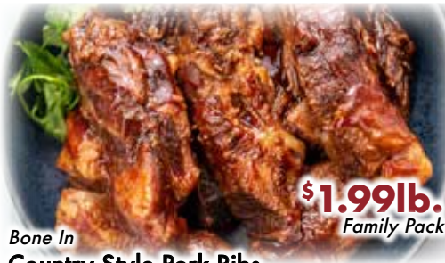
Bone In Country Style Pork Ribs Lesser Amounts, $2.19lb. $1.99lb. Family Pack