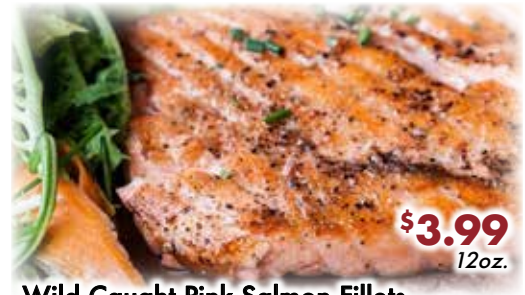
$3.99 12oz. Wild Caught Pink Salmon Fillets