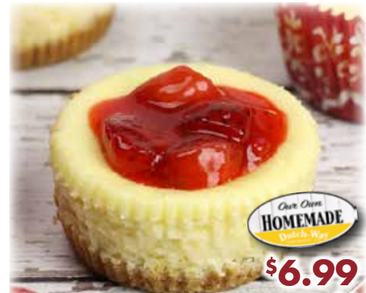
Homemade Strawberry Cheese Cupcakes