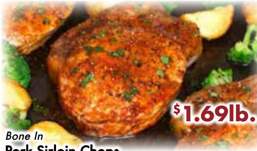
Bone In Pork Sirloin Chops Lesser Amounts, $1.99lb. $1.69lb.