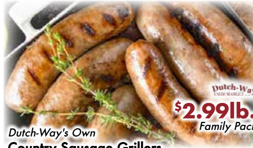
Dutch-Way Dutch-Way's Own Country Sausage Grillers Lesser Amounts, $3.49lb. $2.99lb. Family Pack