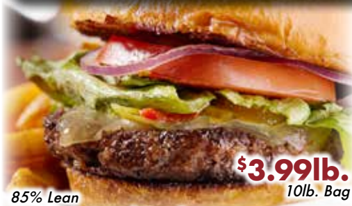
85% Lean Fresh Ground Beef Family Pack: $4.49lb., Lesser Amounts: $4.99lb. $3.99lb. 10lb. Bag