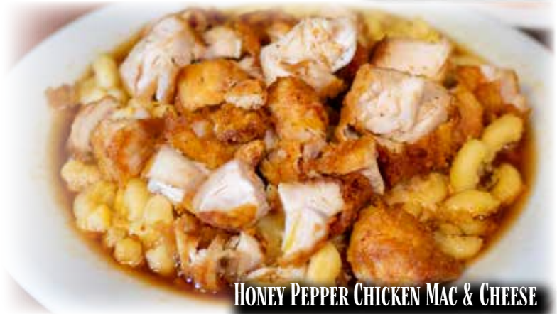
HONEY PEPPER CHICKEN MAC & CHEESE