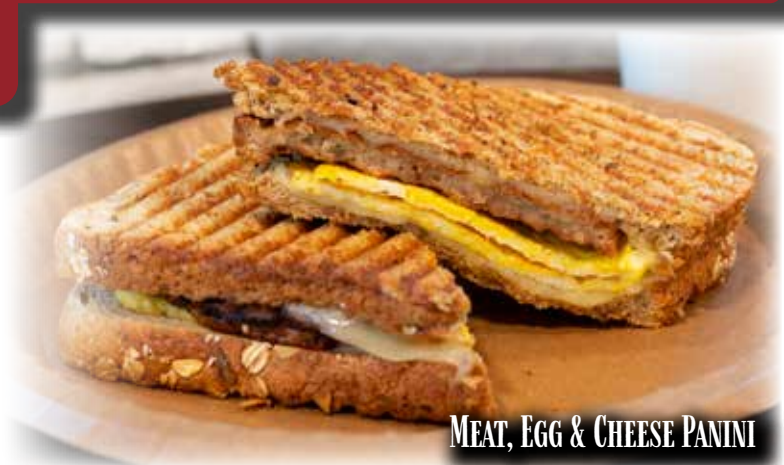
MEAT, EGG & CHEESE PANINI