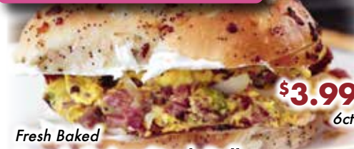
Fresh Baked Egg & Onion Steak Rolls