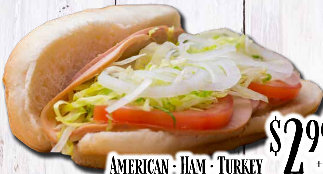
AMERICAN · HAM · TURKEY