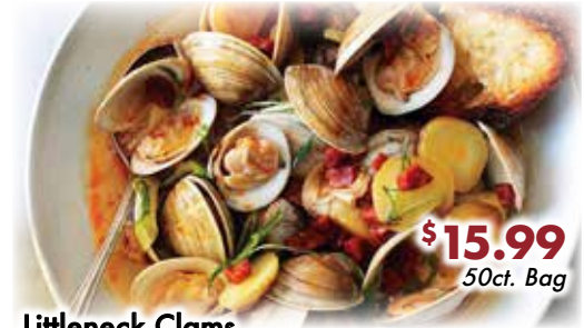
$15.99 50ct. Bag Littleneck Clams