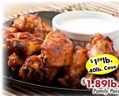
$1.59lb. 40lb. Case $1.89lb. Family Pack Split Chicken Wings Lesser Amounts, $1.99lb.