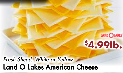
LAND O LAKES Fresh Sliced, White or Yellow Land O Lakes American Cheese $4.99lb.