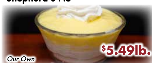
Our Own Lemon Lush Dessert