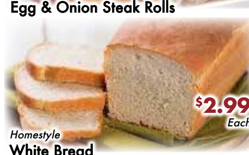
Homestyle White Bread