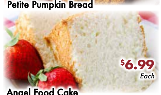
Angel Food Cake