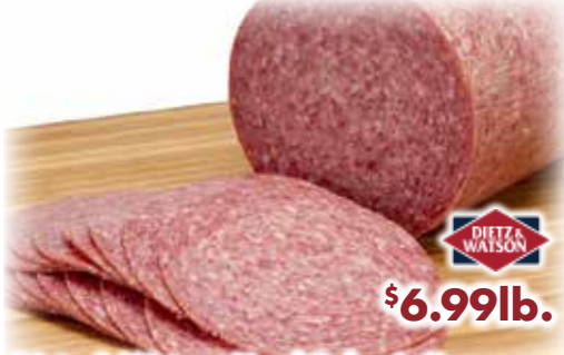
DIETZ & WATSON Dietz & Watson Hard Salami, Genoa Salami or Sandwich Pepperoni $6.99lb.