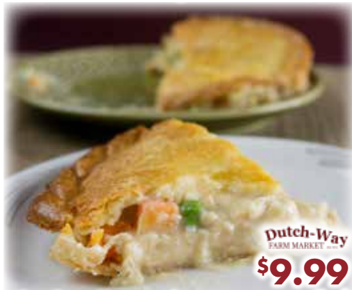
Our Own, Homemade 8 Inch Frozen Chicken Pies