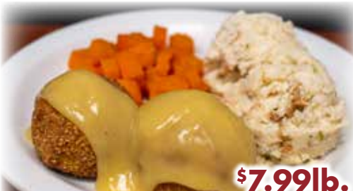
Our Own Chicken Croquette Dinner