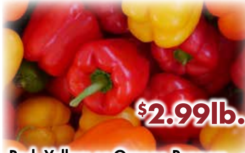
Red, Yellow or Orange Peppers