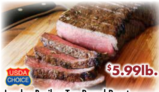
USDA CHOICE London Broil or Top Round Roast $5.99lb.