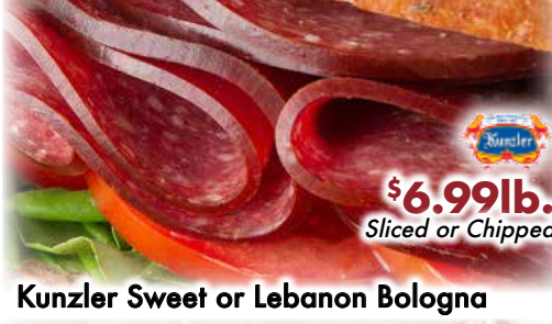
Kunzler Kunzler Sweet or Lebanon Bologna $6.99lb. Sliced or Chipped