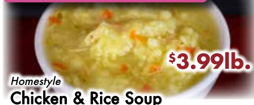
Homestyle Chicken & Rice Soup