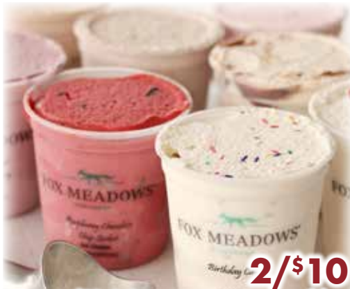
Assorted Varieties Fox Meadows Ice Cream