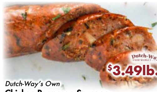
Dutch-Way Dutch-Way's Own Chicken Parmesan Sausage $3.49lb.