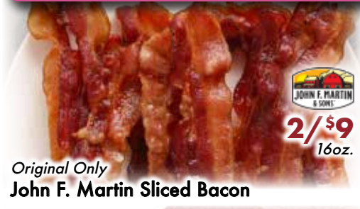
JOHN F. MARTIN Original Only John F. Martin Sliced Bacon 2/$9 16oz.