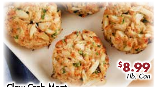
$8.99 1lb. Can Claw Crab Meat