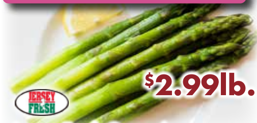
Jersey Fresh Green Asparagus