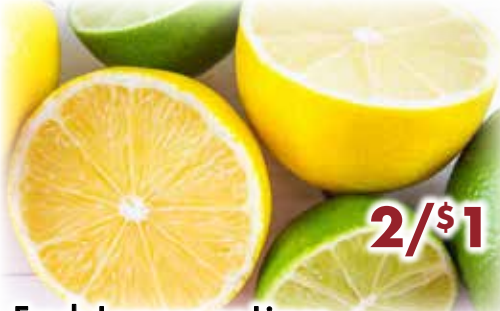
Fresh Lemons or Limes