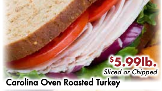
$5.99lb. Sliced or Chipped Carolina Oven Roasted Turkey