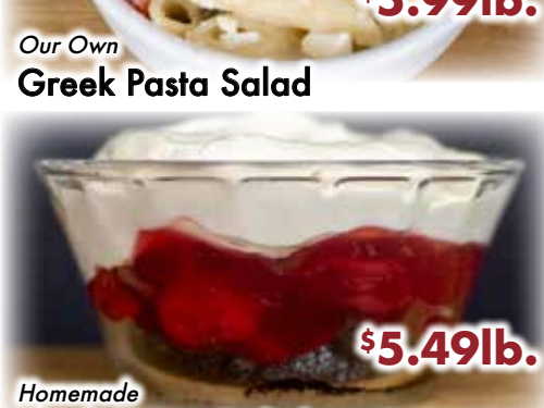
Homemade Black Forest Delight