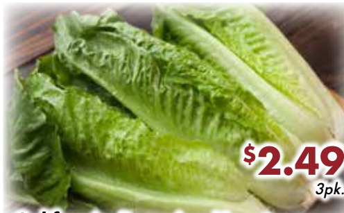
California Romaine Hearts