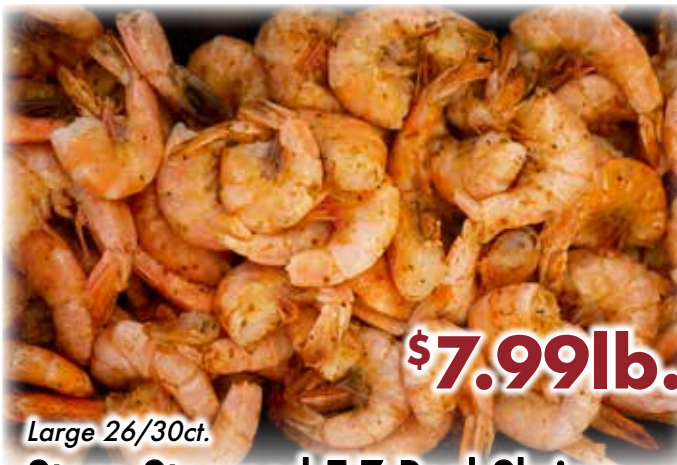
Store Steamed E-Z Peel Shrimp