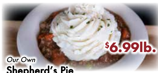
Our Own Shepherd's Pie