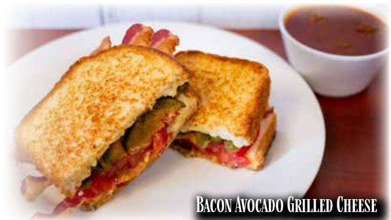
BACON AVOCADO GRILLED CHEESE