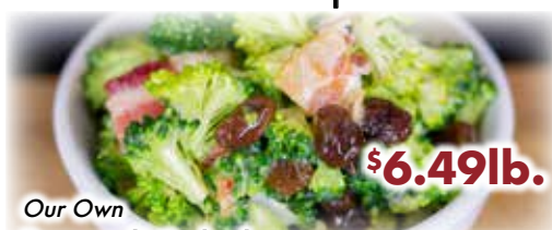
Our Own Broccoli Salad