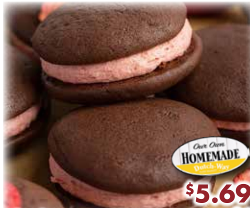
Our Own Strawberry Cream Whoopie Pies