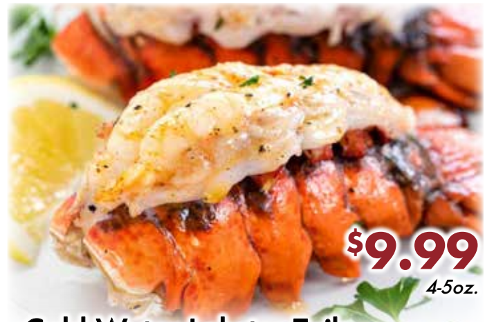
Cold Water Lobster Tails