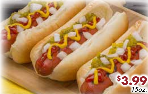
$3.99 15oz. Berks Original or Grill Franks Beef: $4.99 15oz.