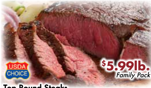
USDA CHOICE Top Round Steaks Lesser Amounts, $6.49lb. $5.99lb. Family Pack