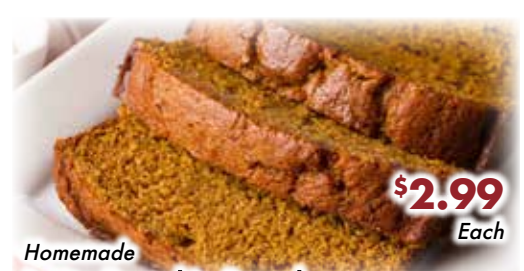
Homemade Petite Pumpkin Bread