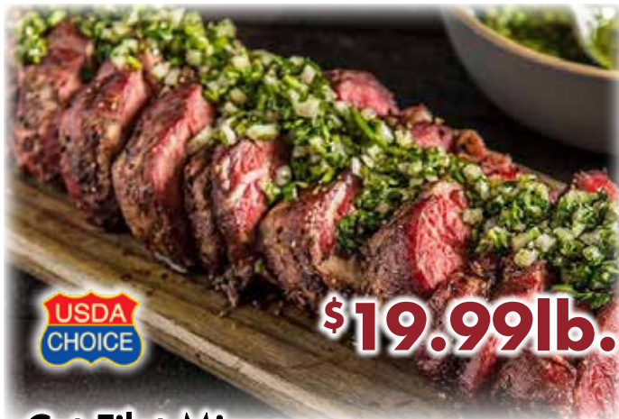
Cut Filet Mignons

Large Selection of Hanging Baskets, Planters and More!