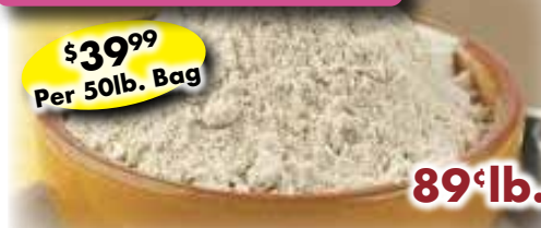
Golden 86 Bread Flour