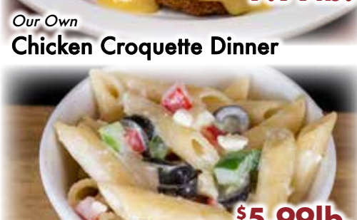
Our Own Greek Pasta Salad