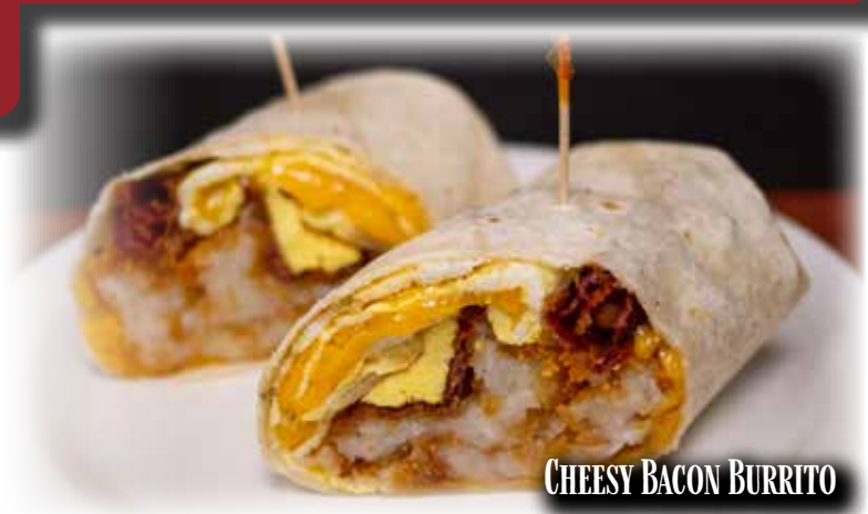
CHEESY BACON BURRITO