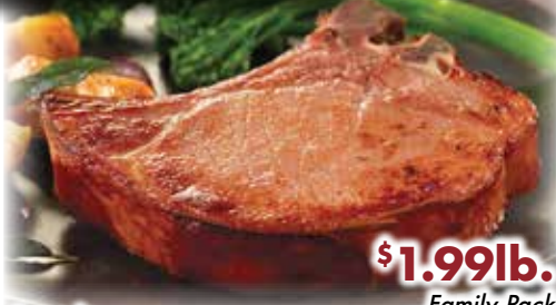
Bone In Regular or Thick Cut Pork Chops Lesser Amounts, $2.19lb. $1.99lb. Family Pack