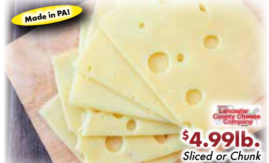
MADE IN PA! Lancaster County Cheese Company $4.99lb. Sliced or Chunk Lancaster County Natural Swiss