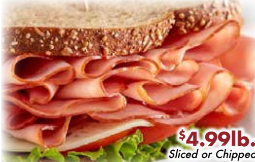
$4.99lb. Sliced or Chipped Smoked Ham