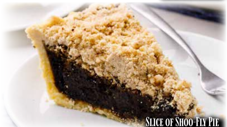
SLICE OF SHOO-FLY PIE