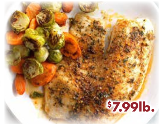
$7.99lb. Fresh Tilapia Fillets