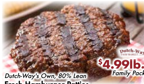
Dutch-Way Dutch-Way's Own, 80% Lean Fresh Hamburger Patties Lesser Amounts, $5.19lb. $4.99lb. Family Pack