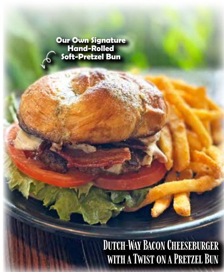
DUTCH-WAY BACON CHEESEBURGER WITH A TWIST ON A PRETZEL BUN