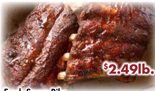
$2.49lb. Fresh Spare Ribs