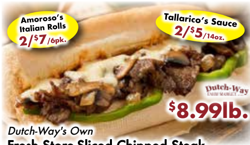
Amoroso's Italian Rolls 2/$7 /6pk. Tallarico's Sauce 2/$5 /14oz. $8.99lb. Dutch-Way's Own Fresh Store-Sliced Chipped Steak