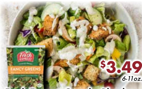
Fresh Express Crunchy Blends